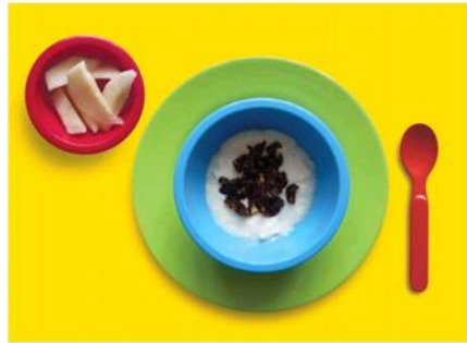
Chopped pears with yoghurt and cooked apple slices