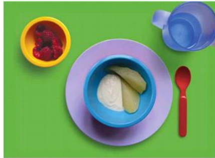
Poached pear with yoghurt and raspberry