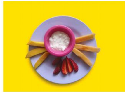
Cottage cheese with quartered strawberries, melon and peach fingers