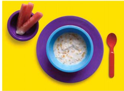
Mango fool with watermelon fingers