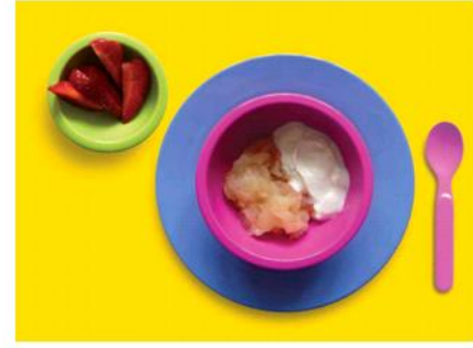
Baked apple with Greek yoghurt and quartered strawberries

Reflect on the quantity of food you give your child in each meal.