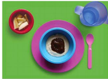
Semolina made with milk, puree prunes and banana fingers